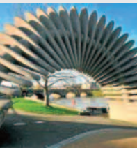
Quantum Leap sculpture created to celebrate the centenary of the birth of Charles Darwin.