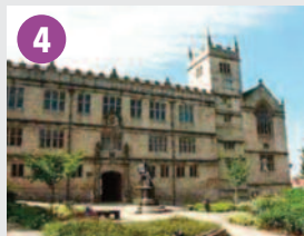
Shrewsbury Library was built in 1550 and served as a school until 1882 when it was converted to a library and museum.