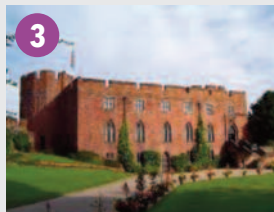
Shrewsbury Castle was constructed in 1067 as a defensive fortification for the town which was otherwise protected by the river