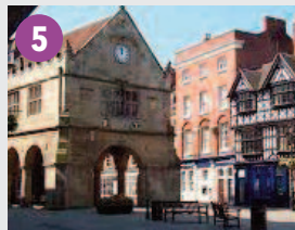
The Old Market Hall was built in 1596 and was originally occupied by the Shrewsbury Drapers Company who sold Welsh cloth.