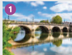
The Grade II listed Welsh Bridge was built in 1795 and crosses the River Severn. The bridge is 266 feet long.